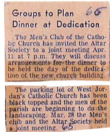
On the right: Men's Club News Articles from 1965